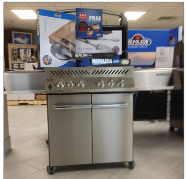
Accessories shown on Prestige® P500RSIB

11" x 17" handle hang card to display on qualifying grills with display of accessories. See right for product and POP display use.